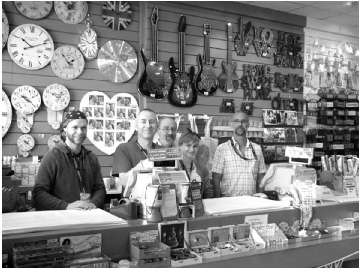
The Evolution Shop Team

You may have often walked past the Evolution gift shop in Bond Street in the North Laine, or indeed the Evolution Clearance store in Western Road, but did you know these are Buddhist-run shops run by a business that gives all its profits to charity?