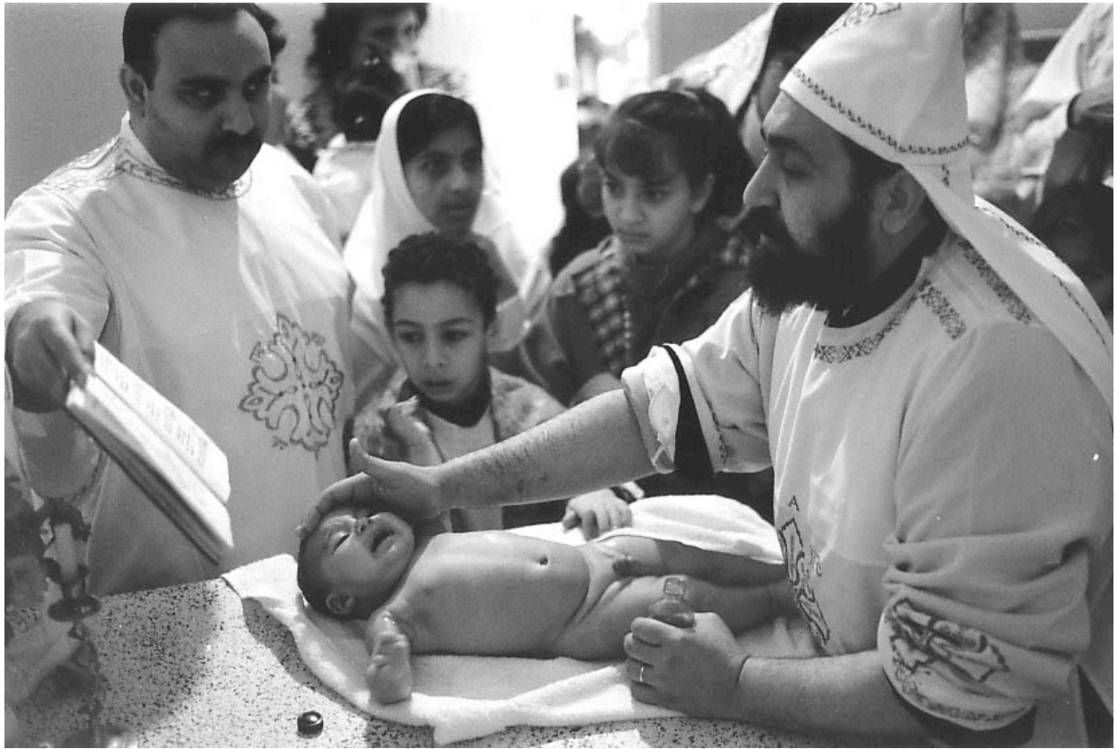
Baptism, Coptic Church